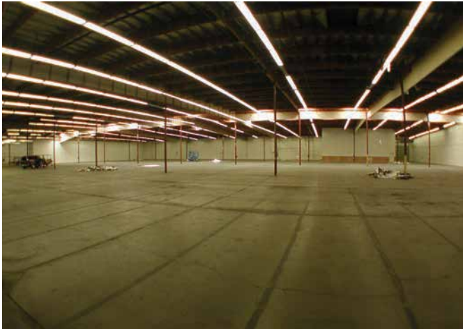
This photo taken with all electric lights on. The lights are 2-lamp 8' fluorescent, T-12s. These fixtures use 63.8 kw per hour to produce a light level of 30 footcandles.