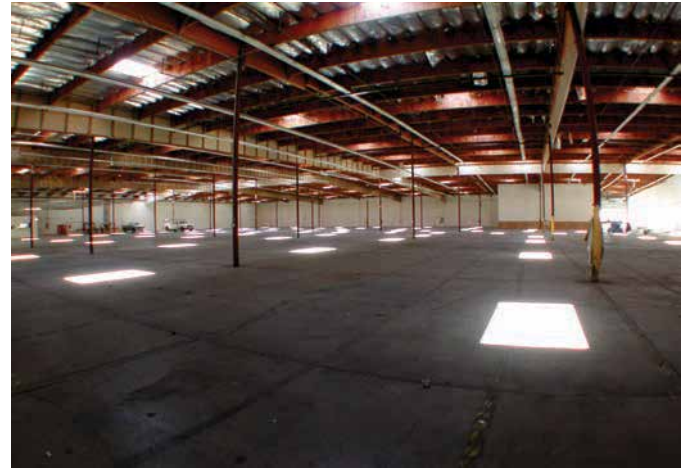
In this photo, all the skylight openings have been cut out and the electric lights are turned off. This is similar to what you find from clear glazed skylights. Daylighting is possible but hot spots cause glare and UV damage.