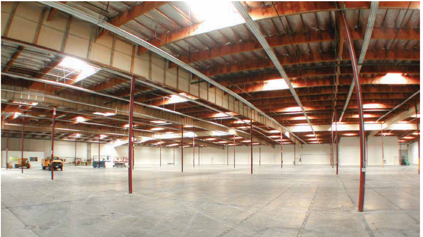
Here's the completed job. Lights are off, the hot spots are gone, and the space looks alive. Footcandles will average 79 instead of 30. At only $0.10 per kwh, the owner will save approximately $14,000.00 per year with a payback for this install in less than 3 years of pure after tax profit back to the company. Zero light energy also produces zero carbon emission. There isn't a more cost effective or energy efficient, green energy technology on the market today.